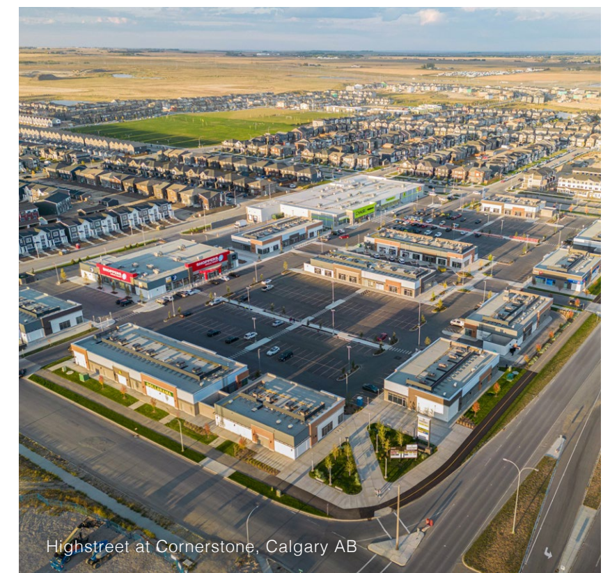
Highstreet at Cornerstone, Calgary AB