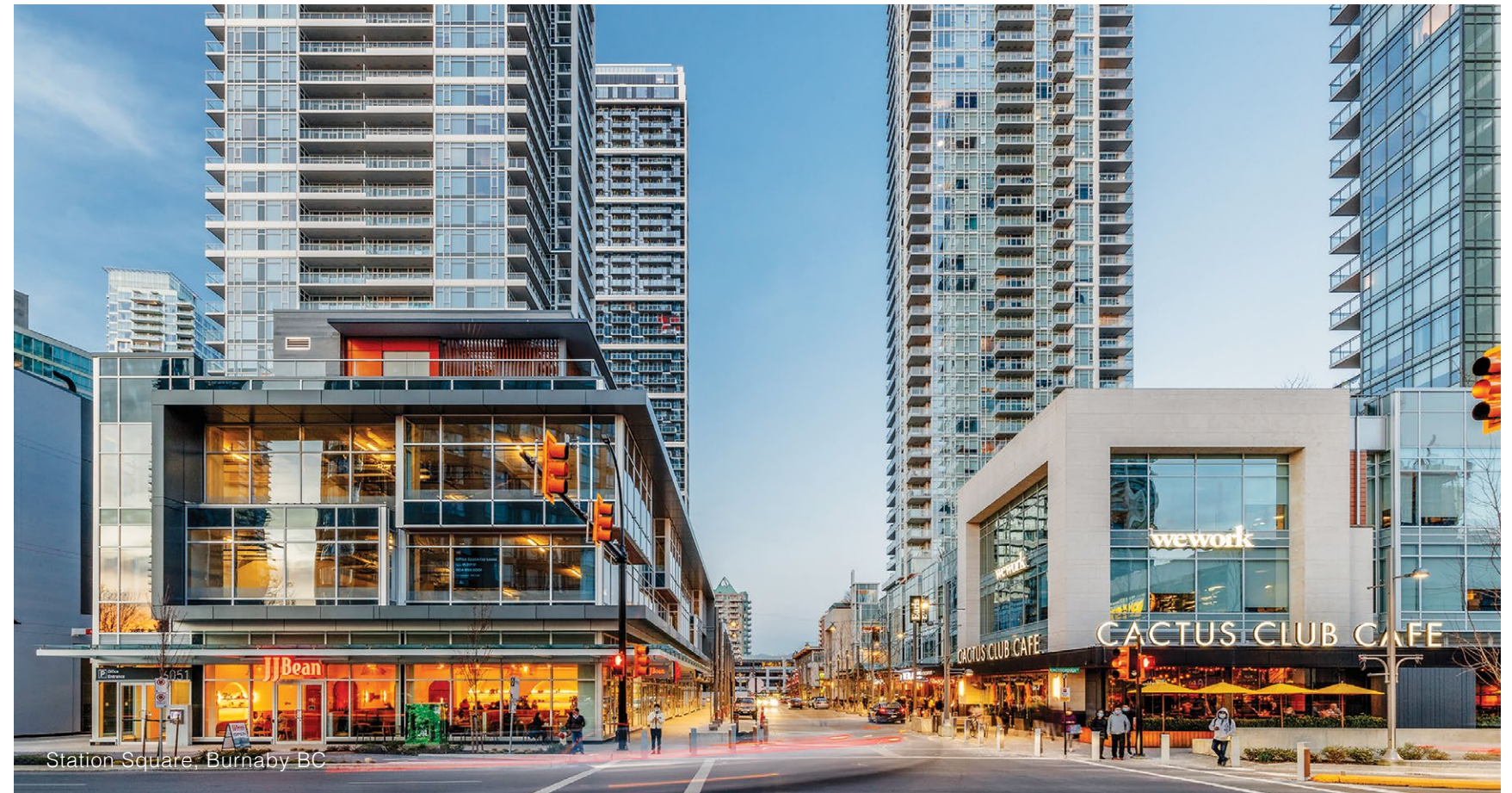
Station Square, Burnaby BC